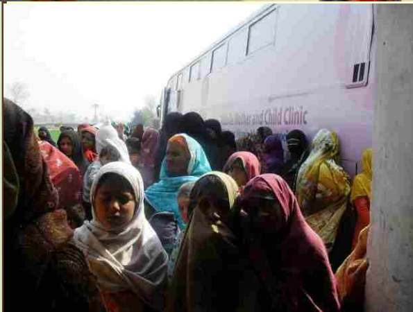
PIMA-DWW (Turkey) IIMA Mobile Mother & Child Health Clinic has so far treated more than 8 thousands patients in remote areas of South Punjab, Pakistan