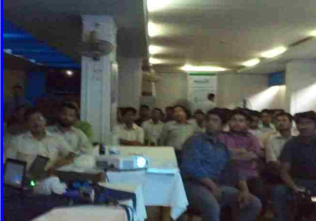
BNDF (IMA of Bangladesh held a welcome reception in the honour of fresh Medical graduates in Dhaka).